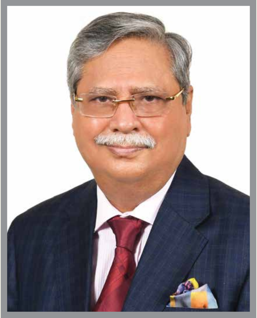
মোঃ সাহাবুদ্দিন মহামান্য রাষ্ট্রপতি গণপ্রজাতন্ত্রী বাংলাদেশ ও আচার্য, বিএমইউ